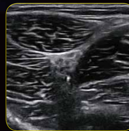
Sciatic Nerve Pop