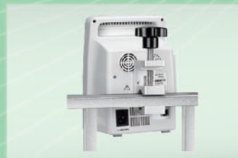
Bed Rail Clamp