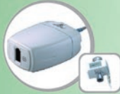
Respironics CO 2