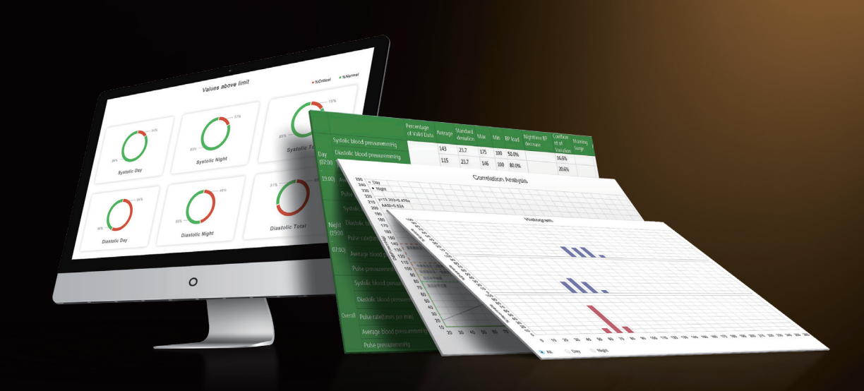
Pie Chart Analysis

With the aid of the SA-10's powerful analysis software, the clinicians can have a better insight into the variation of patient's blood pressure within 24 hours, easily identifying the periods when the blood pressure values are above limits. The informative statistical table provides a clear presentation of the measurement summary throughout the day.