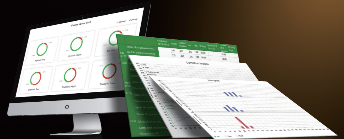
Pie Chart Analysis

With the aid of the SA-10's powerful analysis software, the clinicians can have a better insight into the variation of patient's blood pressure within 24 hours, easily identifying the periods when the blood pressure values are above limits. The informative statistical table provides a clear presentation of the measurement summary throughout the day.