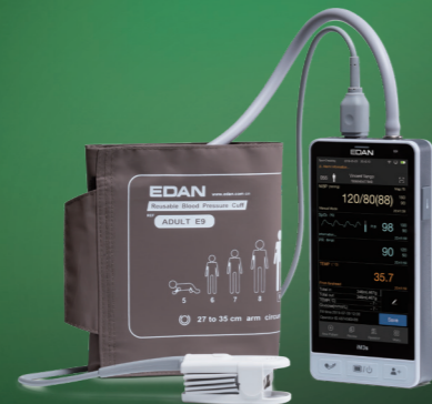
iM3s Vital Signs Monitor