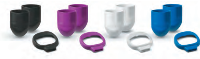
Welch Allyn Pocket LED Handle Bumpers and Otoscope Window Bumpers

Customise with our accessory kit* to mix and match your look.